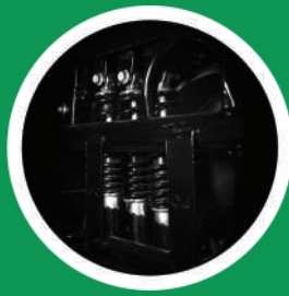
6 Shocker Suspension