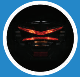
Stylish Tail Lamp