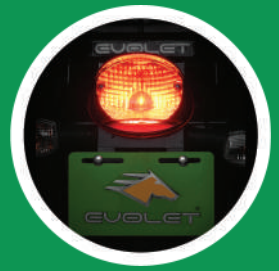
Stylish Tail Lamp