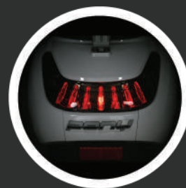
Stylish Tail Lamp