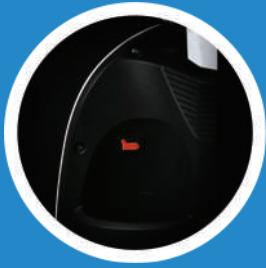
USB Port for charging