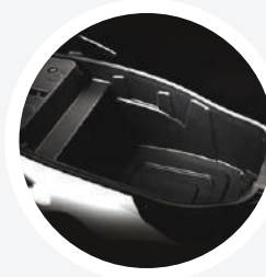
17 Litre Boot Space