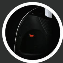
USB Port for charging