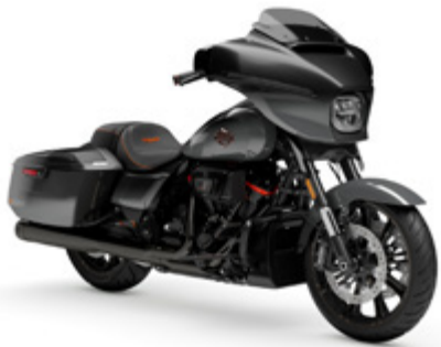
CVO™ STREET GLIDE™