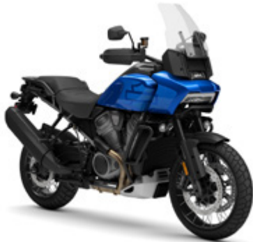
PAN AMERICA™ 1250 SPECIAL