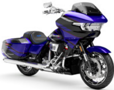
CVO™ ROAD GLIDE™