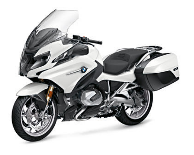
BMW R 1250 RT: 751 Alpine white / Seat in Black