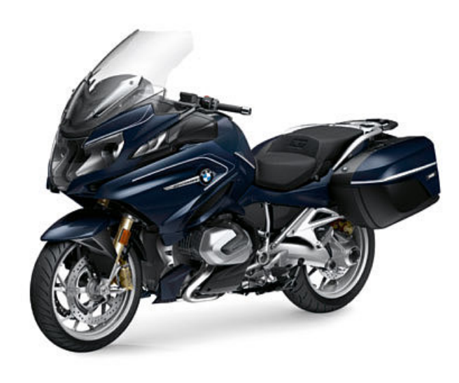
BMW R 1250 RT: Option 719 H0D Blue planet metallic / Ivory / Seat in Black