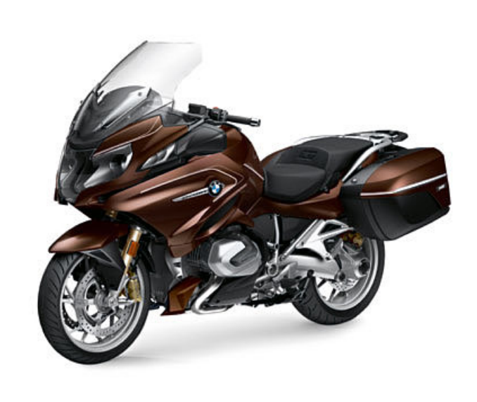
BMW R 1250 RT: Option 719 H08 Star dust metallic / Seat in Black