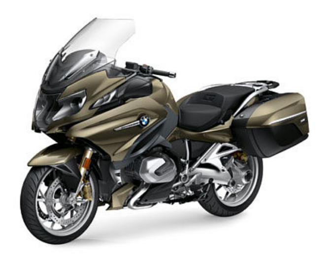
BMW R 1250 RT Elegance: Manhattan metallic N2V / Seat in Black