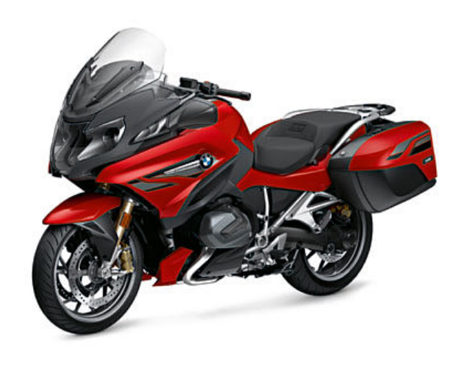
BMW R 1250 RT Sport: Mars red metallic/N1L Dark slate metallic matt / Seat in Black