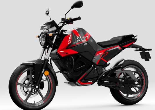
Rorr EZ Sigma 4.4 kWh