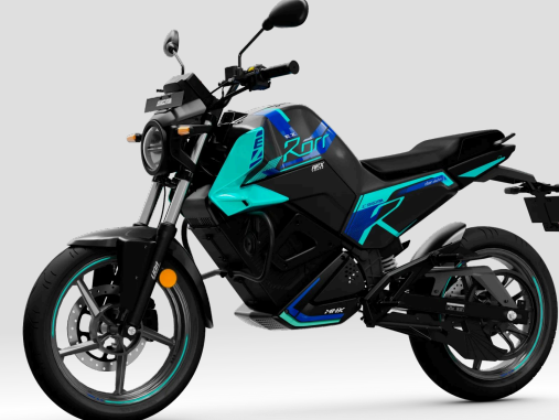
Rorr EZ Sigma 3.4 kWh